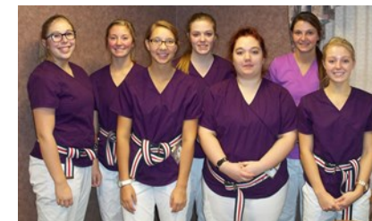
Concord Care Center Clinical Students Westview Care Center